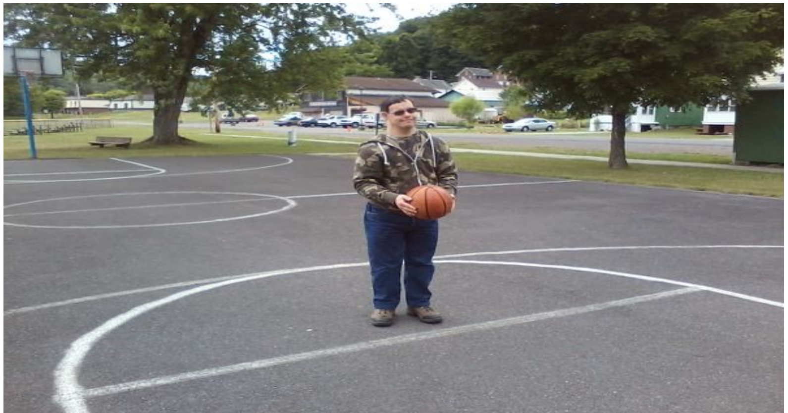
Pictured above is a Dubois participant enjoying a little time on the basketball court!